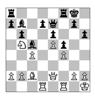
Diagram 41. Geller– Boleslavsky, after 19...Ra8 (analysis)

It was essential for Black to preserve both bishops. Worthy of consideration is the mysterious looking 19...Ra8, which also helps inhibit White's expansion on the queenside.